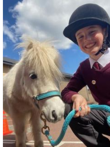
Barn Buddies helped us learn about looking after animal wellbeing & reflect on our own