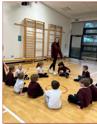
Side Kicks training led by our Active School Club Coordinator & YFCL