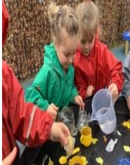
Getting curious in the Nursery