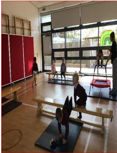
Mini Movers in action. Led by EY Team & YFCL