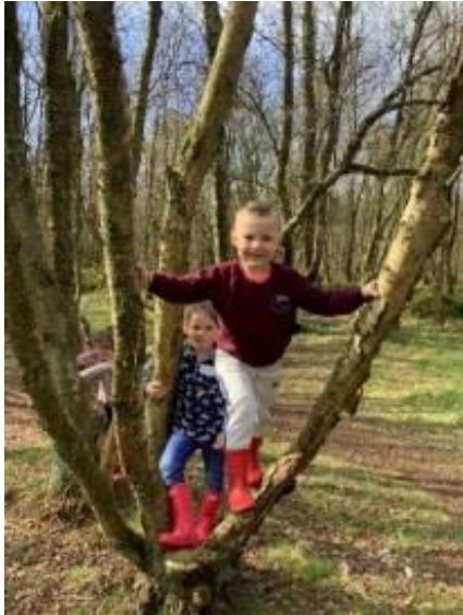
Our Funky Forest is a great resource on our doorstep.

In our ELC & Primary, we try to make best use of the area, local businesses and through visiting specialist to give our learners first hand experiences. Here is just a small sample below to highlight these: