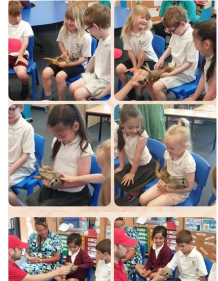
Visiting specialist enhanced our learning