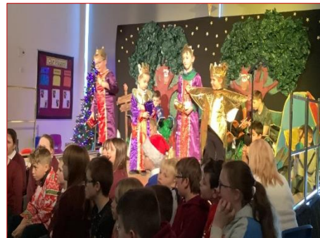
Christmas nativity was a mix of live & digital performance ensuring an inclusive approach