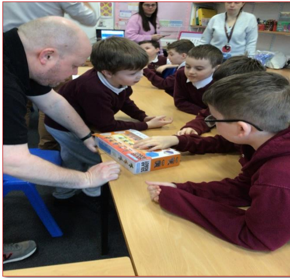
STEM focus day in full swing, creating a model village with vehicles.