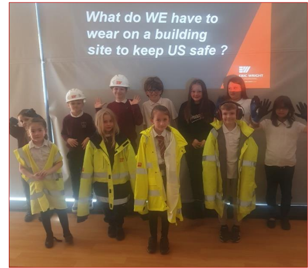
Partnership working with Clyde Bridge project, learning about bridges, the roles within the team and keeping safe near a site.