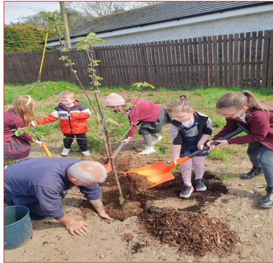
Some of our pupils getting the orchard underway.