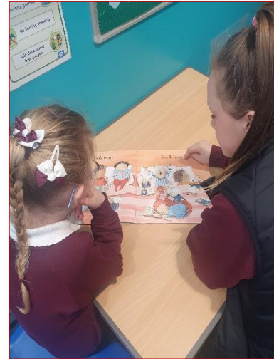
Our Paired Reading in action. Pupils were supported by our Support for Learning teacher & YFCL