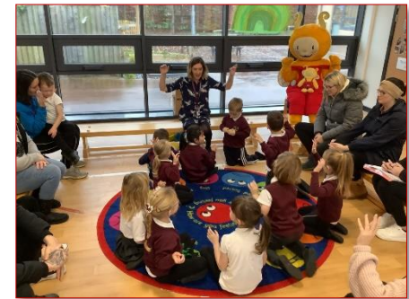
Book bug session with our ELC learners and parents/carers